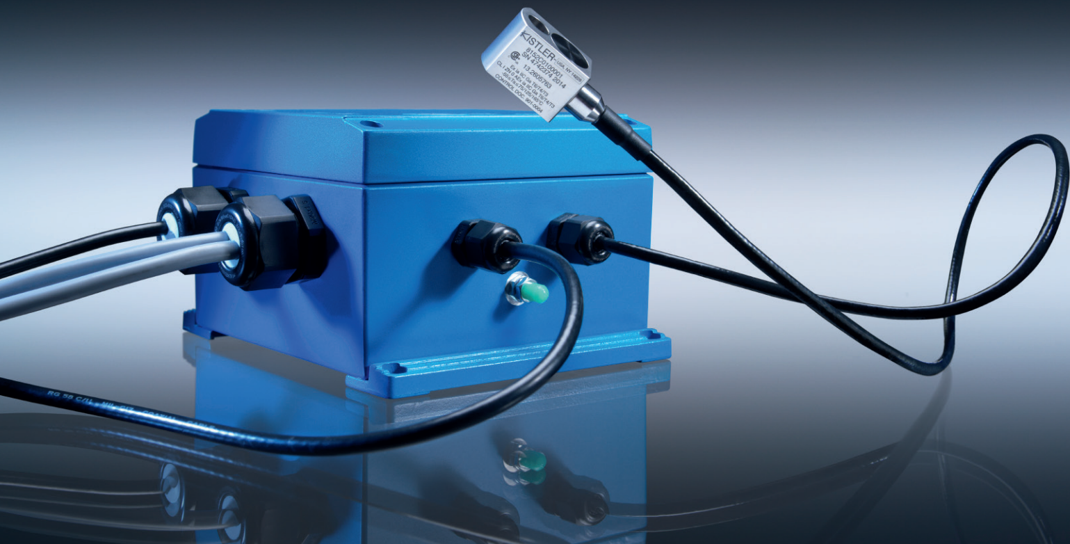
Rugged, watertight and high temperature Acoustic Emission Sensor 8152C connected to the modular 5125C coupler.